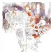
DEANNE CHEUK (YG4)